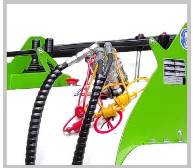
Hydraulic quick coupler sockets for the two hydraulic functions