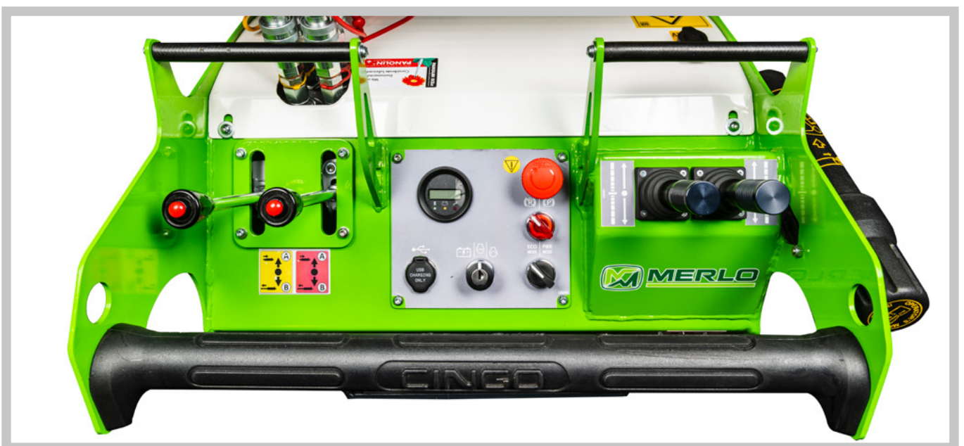
Ergonomic and intuitive driver's seat