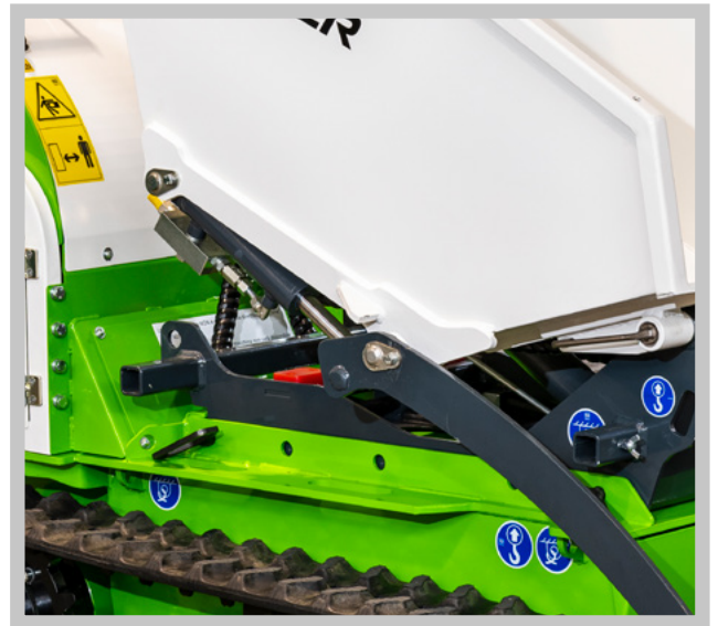
Frame for installing attachments for quick and easy replacement of available accessories