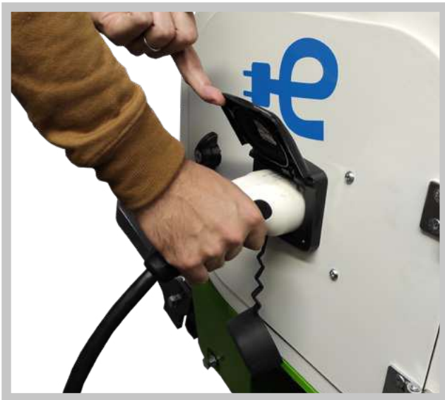
Easy and quick battery charging